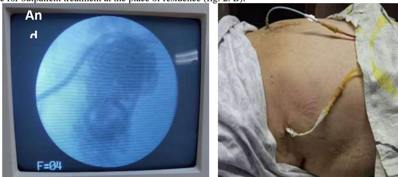
Rice. 2. The volume of the pathological formation (A) and the installed drainage tubes (B).

On the 3rd day after drainage flooroSTI liver abscess appeared signs biliary excretion with an admixture of pus. On the 5th day from the moment of hospitalization there was a deterioration in the patient's condition. There were signs of an increase in body temperature (up to 39 C) nausea with vomitouch and leukocytosis. With control ultrasound and computed tomography examinations was diagnosed additional pathological hearth ino II segment of the liver (fig. 1. B), which is rubbedthe installation of additional percutaneous percutaneous peregastric drainage. During repeated bacteriological examination of the discharge from the drains, a culture was isolated Enterobacter aeruginosa , чувствительная Was to meropenem. Patient started purposeful antibiotic therapy. As the syndrome of systemic inflammatory response is stopped and stopped excreta purulent discharge through the drains with Reducing Size Cavities Liver in control studies with contrast and on Ultrasonicsohm Research painDischarged home with drainage tube for outpatient treatment at the place of residence (fig. 2. B).