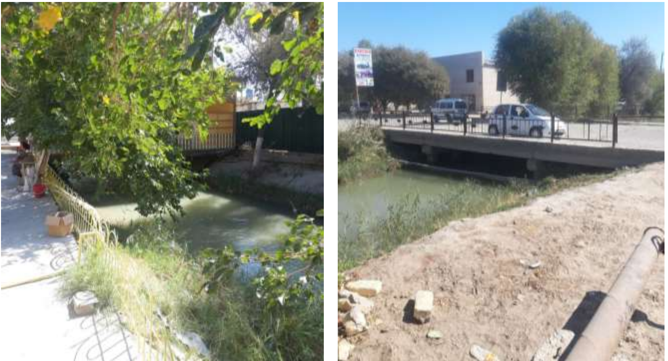
Figure 3. Overall view of the Ak-Yab canal

The reconstructed part of the Ak-Yab canal will supply water to 3,975 hectares of land on the territory of the Kenik-Polvon and Boz-Yab Water Consumers Associations (WCA) (Figure 3). The orientation of these WCAs by crop type is based on cotton. The normal water flow capacity of the canal is 5.0 m 3 /sec, and the length of the canal is 3,431 km, of which 2,047 km are soil-founded (PK88 + 55 to PK102 + 60 and PK116 + 44 to PK 122 + 86), and 1,384 km (PK102 + 60 to PK 116+). 44) with concrete coating. According to the research output, it is necessary to reconstruct the part of the canal from PK89 + 55 to PK122 + 86.