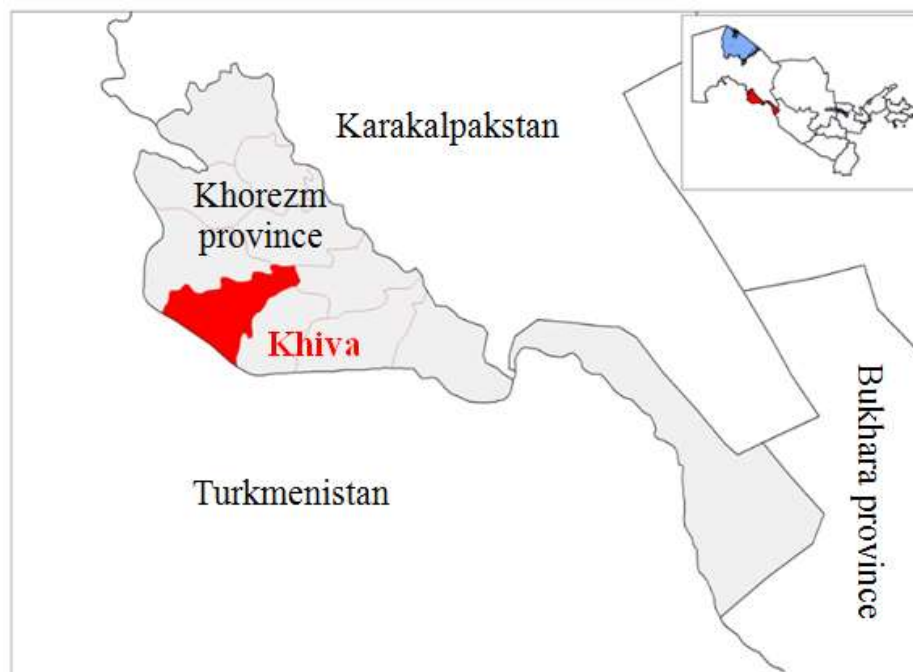
Figure 1. Map of the study area

Khiva district is an administrative unit in Khorezm province of Uzbekistan. The administrative center is the city of Khiva (Figure 1). Khiva district was formed in the 1920s and in 1938 became part of Khorezm province.