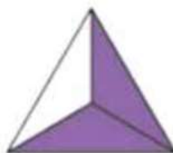
To the 2nd student