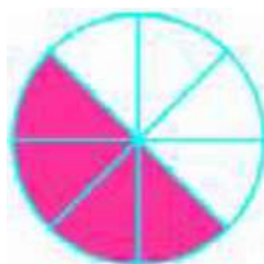
To the 3rd student